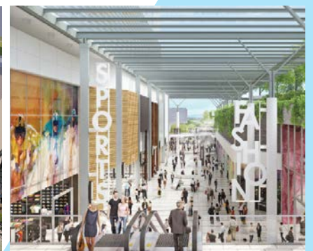
Lougheed Town Centre