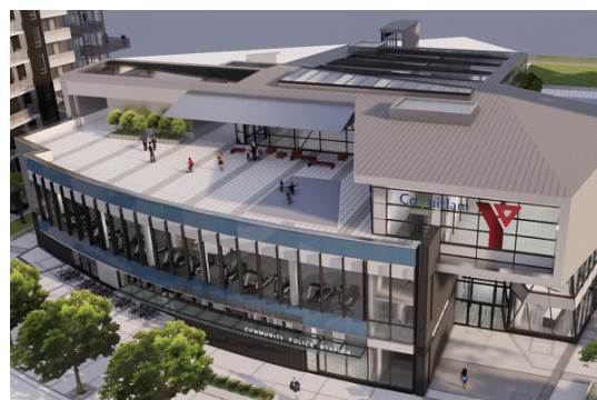
New YMCA Image by Concert Properties.