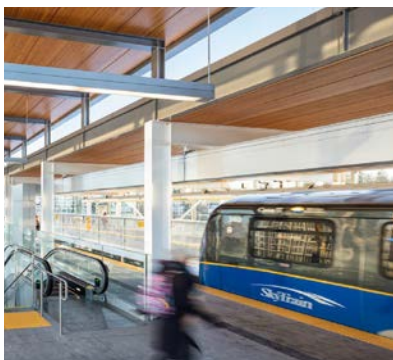
Walking distance to SkyTrain